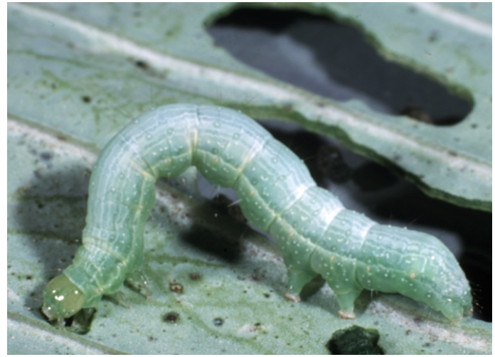
Cabbage looper and frass.

1). Scout and hand pick. Keep a close eye on your plants, scouting every few days for caterpillars, eggs, or signs of damage. The eggs are easy to miss, but if you do find them simply crush them with your thumb. Caterpillars are hard to see because they are the same green color as your plants, but pay close attention to the undersides of leaves. Often, the first clue to the caterpillars' presence is frass (caterpillar poop). Look for piles of round, moist, dark green frass on leaf stems and in the head or growing tip of the plant. If you find frass, or see leaf damage, there's a caterpillar there somewhere! When you find it simply crush it with your fingers, snip it in half with scissors, or drop it into a pail of soapy water.