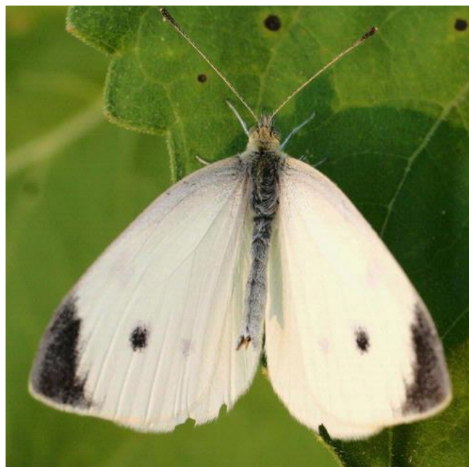
Cabbage worm butterfly.