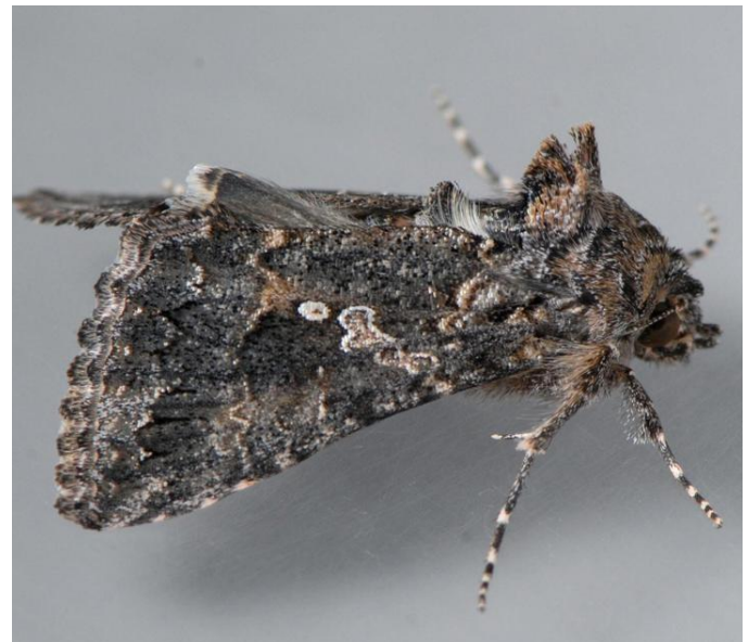
Cabbage looper moth.