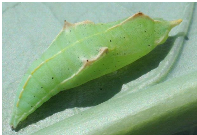
Cabbage worm pupae.

"Cabbage Looper." North Carolina State University Cooperative Extension, Extension Integrated Pest Management Program. Viewed March, 2012: [link]