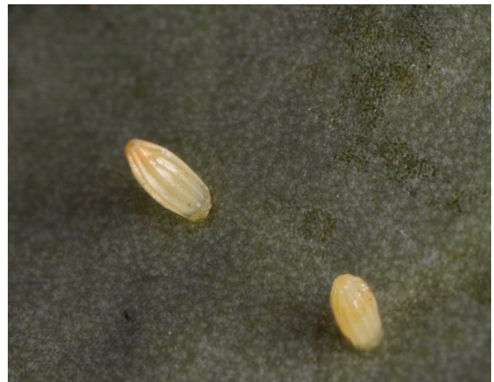
Cabbage worm eggs.