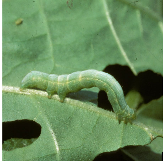
Cabbage looper larva and damage.

The adult Imported Cabbage Worm butterfly is white to yellowish-white with black wing tips and 2 – 3 black spots on each wing. The caterpillar or larva is green with faint yellow stripes down its back, and is covered in tiny hairs. They are slow moving. Eggs are whitish yellow, cone-shaped, and laid on the undersides of leaves.