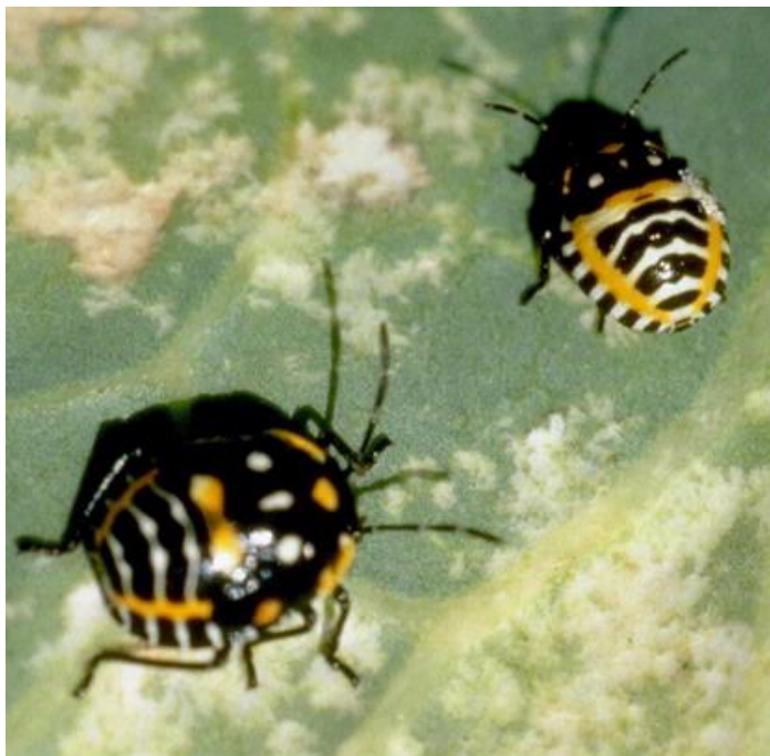
Harlequin bug nymph and damage.

5) Use row covers. Keep stink bugs from finding your crop by covering your brassica plants with a lightweight "floating" row cover such as Reemay. These materials (as opposed to plastic or heavier fabrics) let water and air through and do not block very much sunlight. They can be found at garden supply stores or ordered from seed catalogs. The covers can lie directly on the plants (the plants will lift the cover as they grow), or you can support the covers with wire hoops. The trick is to keep the edges of the covers tightly buried or weighted so that the stink bugs cannot get in.