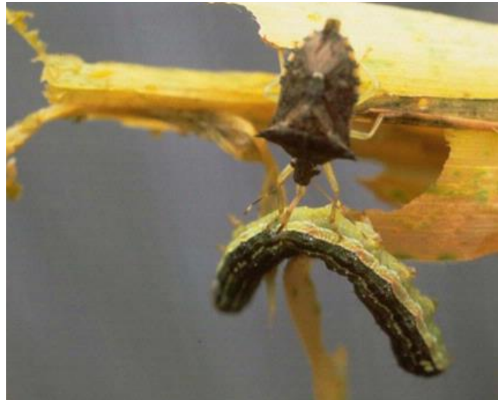
Spined soldier bug (i.e. the good guys – note the big pointy shoulder pads!)