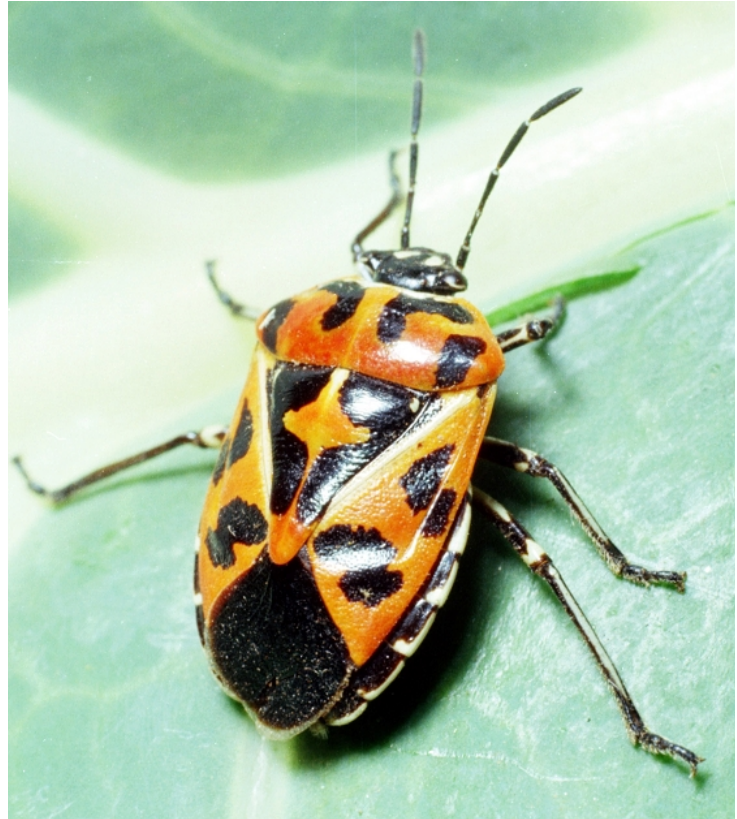
Adult harlequin bug.

Some predatory stink bugs, such as the spined soldier bug, actually attack other garden pests. They should be encouraged in the garden. The spined soldier bug looks similar to a brown stink bug, but has spikes standing out on its shoulders.