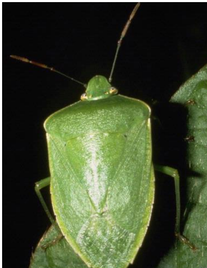
Green stink bug.