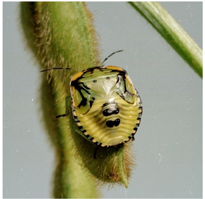
Green stink bug nymph.

Sprays are usually only effective in slowing stink bugs down, not stopping them. Adult stink bugs and their eggs are very resistant to sprays. Spraying should be done soon after the first eggs hatch and the nymphs have come out. The sprays must come into contact with the nymphs to work, so try to cover the whole plant. Weekly sprays may be needed since new stink bugs hatch all season long. Obviously, even “organic” sprays come with risks and problems, so try the other tips here first, and you may be able to skip the sprays altogether.