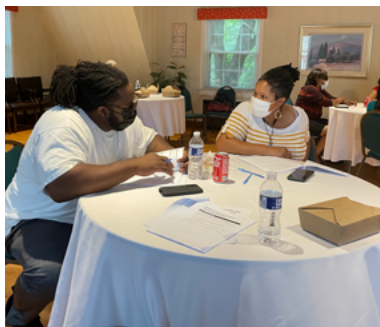
In 2022, community leaders gained training and tools for advocacy through 32 events on clean water, farmworker justice, biodiversity protection, environmental health, local solutions, and more.