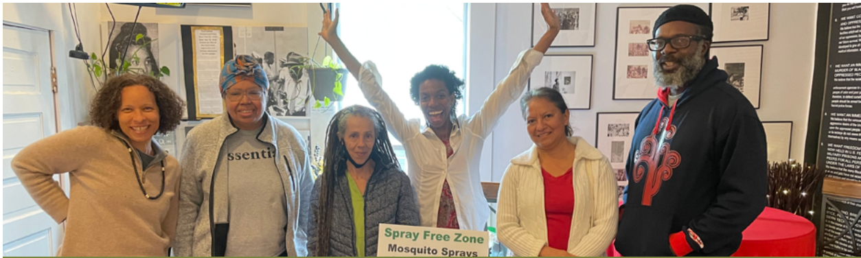
Toxic Free NC supported the launch of a grassroots growers cooperative led by our partner Island CultureZ in Winston-Salem.