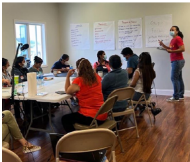
We launched the Environmental Justice Academy, a series of workshops for farmworkers and families to discuss climate and environmental justice issues and build skills for advocacy.