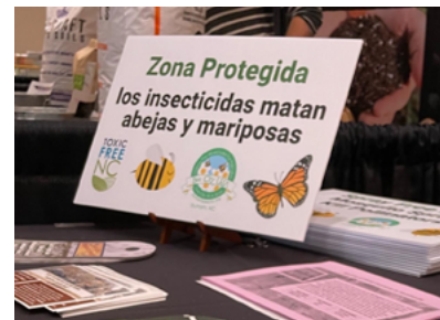
In 2022, NC neighbors posted 92 Spray Free Zone yard signs to spread awareness about pesticide impacts on pollinators and biodiversity. Now available in Spanish!