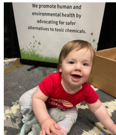
With your support, 1,100+ families received tools and resources to protect environmental health and advocate for safer protections.

Will you give today to support the movement for a toxic-free future?