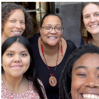
Thanks to supporters like you, Toxic Free NC's amazing team is working to advance environmental health and justice for everyone in North Carolina.